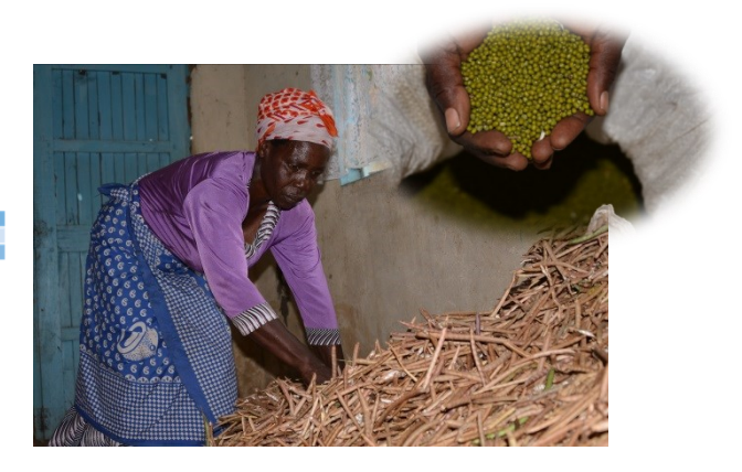
A smallholder farmer in Tharaka Nithi County, with her green grams harvests. She is a member of WFP supported group that sells their food to schools in their county.

WFP purchased 477 mt of maize and sorghum (valued at USD 463,000 or KES 46.3 million) from 10 farmer organizations in Uasin Gishu, Trans Nzoia and Tharaka counties. WFP also trained close to 7,000 farmers (56 percent women) on good agronomic practices, leadership, financial literacy and gender. Over the next financial year (2015/2016), WFP and the State Department for Agriculture will focus on group governance and access to finance by farmer organizations. There will also be an emphasis on policy and legislation issues to enhance participation by smallholder farmers in public procurement.