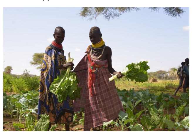
Women picking kales (Sukuma wiki) and spinach from an FFA-supported farm in Turkana County

WFP has contracted the International Food Policy Research Institute (IFPRI) to design an impact evaluation of the asset-creation activities in Kenya. The evaluation's primary objective is to assess and strengthen WFP's ability to contribute to resilience building and self-reliance among the assisted households. Emphasis will be placed on learning, including how identified challenges and lessons will improve future programming. The evaluation report will be action-oriented to ensure that the households and communities supported by FFA projects become increasingly independent of external support.